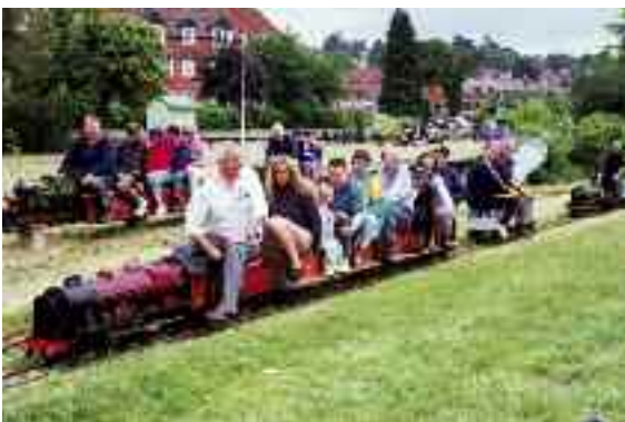
Passengers enjoying rides on both elevated and ground-level tracks at a club open day

3 The book replaces Technical Note 3 Guidelines on the application of the Health and Safety at Work Act 1974 to miniature railways , issued by Her Majesty's Railway Inspectorate (HMRI) in August 1992. The revision is necessary because of a major shift in health and safety legislation towards risk management through assessment. The new guidance also differentiates between the safety requirements for fairground and amusement park rides and attractions and those for miniature railways.