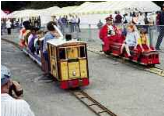
Portable track in use at an outside event

41 Portable track (consisting of pre-formed track panels complete with rails, fixings and sleepers) needs to be erected so that the track is level. Any packing necessary to achieve this levelling should be of suitable size and material to ensure that it can bear the loads imposed upon the tracks and transfers them to the ground without distortion. The spacing of any packing should be close enough to prevent twist and the support should be rigid enough to prevent significant deflection under traffic.