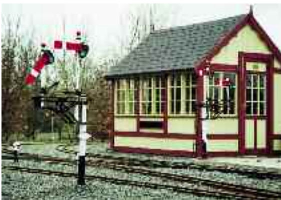
Semaphore signalling at the departure end of a station showing controlling signal box

60 Where a signalling system is installed on a miniature railway, the complexity will depend on the type of line and the speed and frequency of trains.