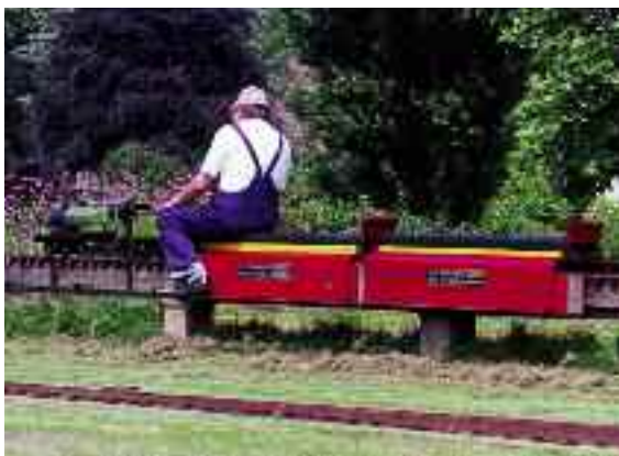
Elevated track passenger carriages showing valances and flexible coverings between the top and sides of the vehicles

79 On miniature railways where propelling of trains takes place, you need to consider ensuring the lateral stability of the vehicles within the train during this operation.