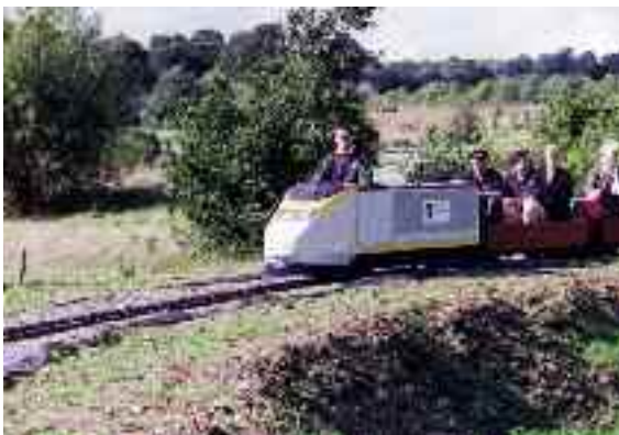
Track on an embankment showing side clearances to allow for passengers to get off the train in an emergency

47 Any earthworks need to be graded to provide long-term stability while allowing the use of mechanical machinery for grass cutting etc and safe access for maintenance. Precautions may be required in steep-sided cuttings to ensure materials do not fall onto the line.