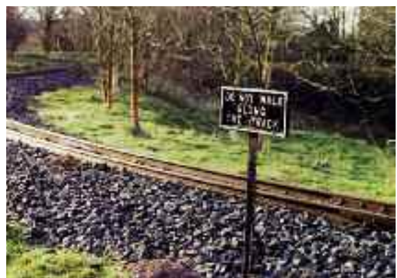
An example of ground-level track showing sleepers, fixings and ballast

changes. The fixings used to secure the ends of the rails should hold them in vertical and horizontal alignment and, where appropriate, accommodate expansion and contraction.