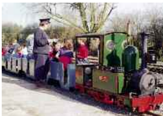
Sit-inside passenger carriages on a ground-level track

76 Rolling stock should have adequate suspension, buffers and couplings to ensure that it can be operated safely.