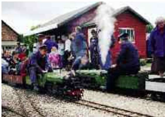
A general scene on a ground-level track

11 General principles to ensure safe practice are provided but the various organisations representing specific aspects of miniature railways may wish to develop and publish their own detailed standards.