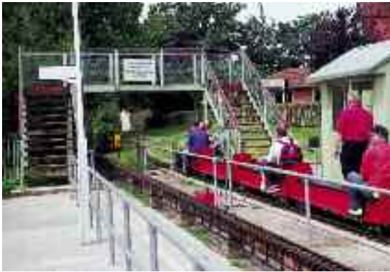
Station layout showing both elevated and ground-level tracks with safety fencing and overbridge for access

52 Stations should be designed with straight platforms where practicable but in all cases there needs to be good visibility for the train crew of the full length of the train. They should be on as level gradient as is possible. Any buildings or canopies need to be built and located so as not to interfere with the driver's line of sight.