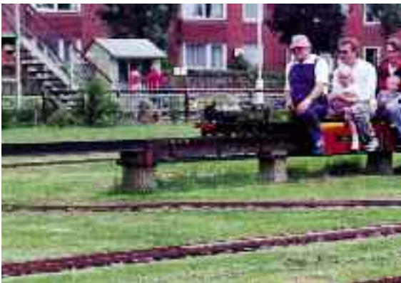
Train running on an elevated track with concrete supports and longitudinal timber beams

32 An adequate system should be provided to prevent any passenger-carrying vehicles from tipping. This may be achieved by a combination of suitable design of the track structure, provision of anti-tipping rails, or the design of the vehicles.